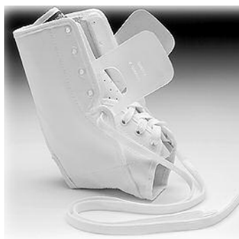
With Optional Plastic Support Inserts